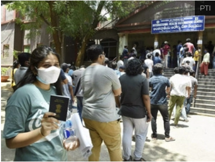
Representative Image.

The minister further said that, in line with the National Education Policy (NEP) 2020, the government encourages high performing Indian universities to set up campuses in other countries, and similarly, selected universities from among the top 100 universities in the world will be facilitated to operate in India.